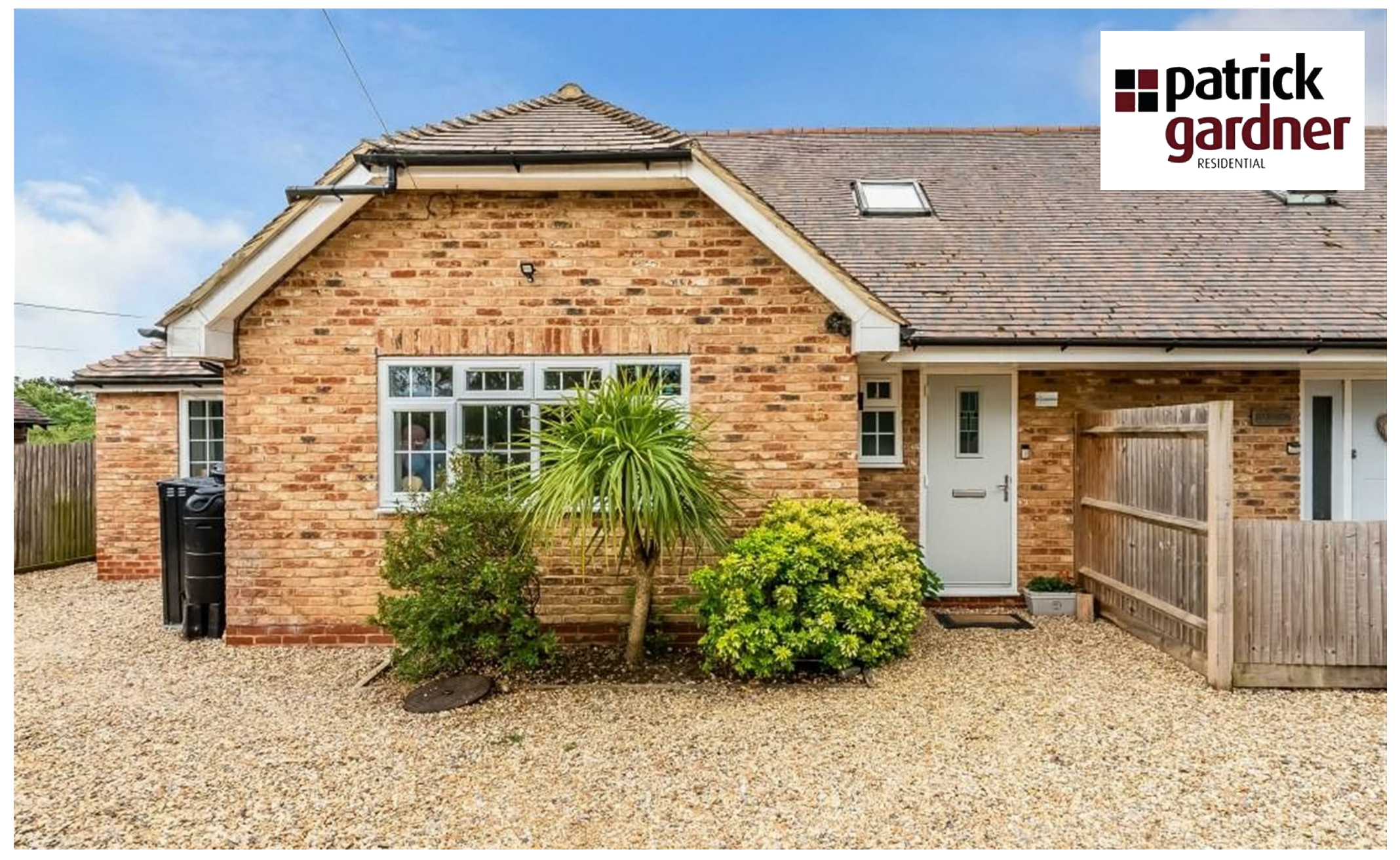
Gables Horsham Road, Capel, Dorking, Surrey, RH5 5JH